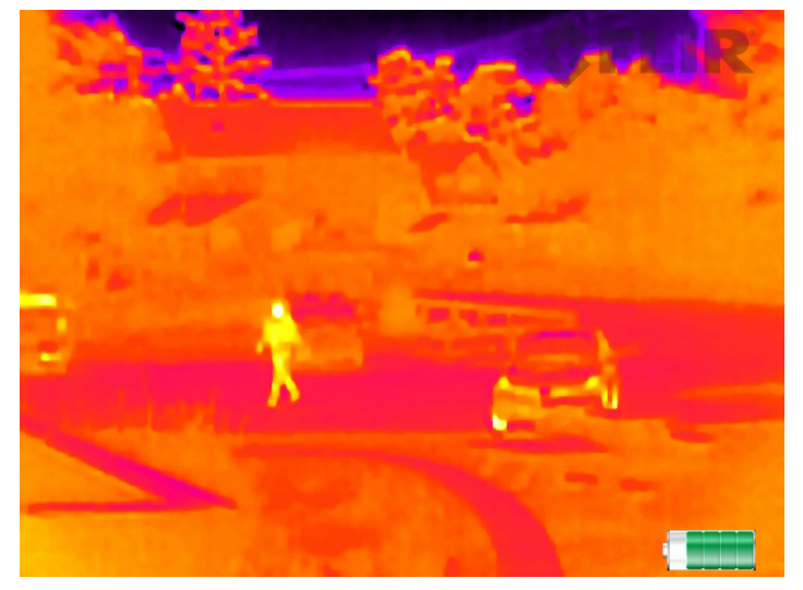
The FLIR Scout TKx helps you stay aware in the dark of night

The FLIR Scout TKx is a pocket-sized thermal vision monocular for exploring the outdoors at night and in lowlight conditions. This thermal monocular with an extended battery life reveals your surroundings, allowing you to clearly see people, objects, and animals from more than 90 meters (100 yards) away. The Scout TKx records thermal images or video in multiple color palettes that can enhance viewing, including InstAlert<sup>™</sup>—a greyscale palette that adds color to highlight the hottest object in the scene. Simple to use, the Scout TKx is the perfect companion, whether in the countryside or on your own property.